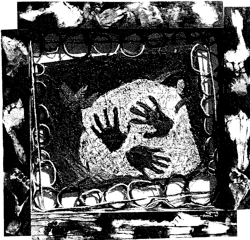
Sosteniendo el Tiempo (1998), Satenik Tekyan. Mixed media, 95 cm × 80 cm. www.artesur.com/satenik .

F CHARACTERIZATION What do you learn about Rolf and Azucena in lines 108–124? What do the last two sentences suggest about Rolf's character?