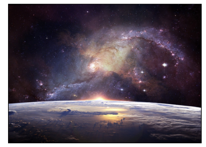
"Untitled" by lumina obscura is licensed under CC0

"They use the radio waves to talk, but the signals don't come from them. The signals come from machines."