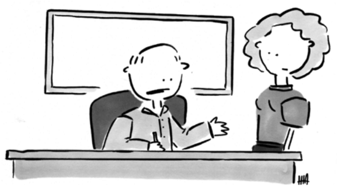
"I don't understand! It just shouldn't be this hard to write a haiku!"