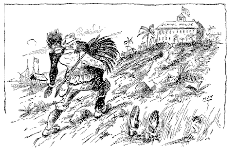
THE WHITE MAN'S BURDEN .- The Journal, Detroit.