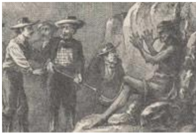
Illustration of the Petrified Man from 1882 edition of Twain's Sketches, New and Old.

The following news report appeared in the Territorial Enterprise , Virginia City, Nevada's leading newspaper, on October 4, 1862: